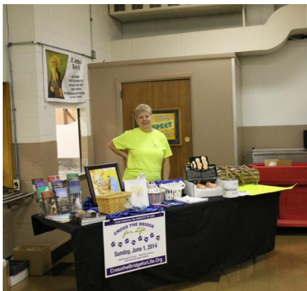
St. Anthony Festival