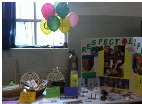
St. Piux X Festival